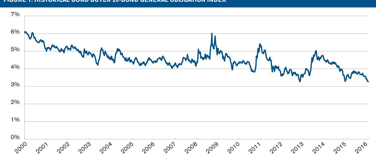
FIGURE 1: HISTORICAL BOND BUYER 20-BOND GENERAL OBLIGATION INDEX

Note that blended discount rates were applicable under GASB 43 and 45 for plans that contributed some amounts, but less than the annual required contribution. The calculation of the blended discount rate under GASB 74 and 75 is fundamentally different.